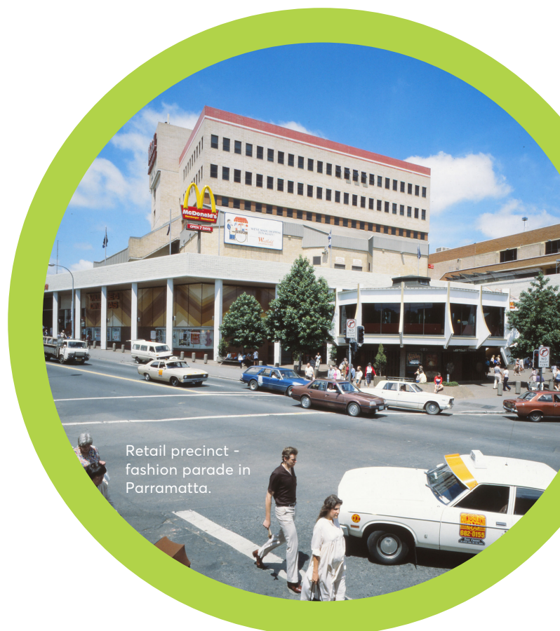
Retail precinct - fashion parade in Parramatta.

Failure to acquit the grant will affect any future funding requests.