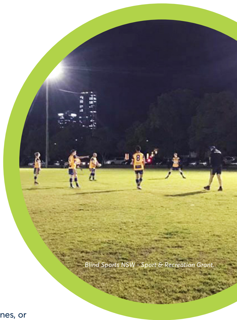
Blind Sports NSW - Sport & Recreation Grant.

If you need assistance in understanding these Guidelines, or have any questions, please contact the Community Capacity Building Team on 9806 5110 or email grants@cityofparramatta.nsw.gov.au .