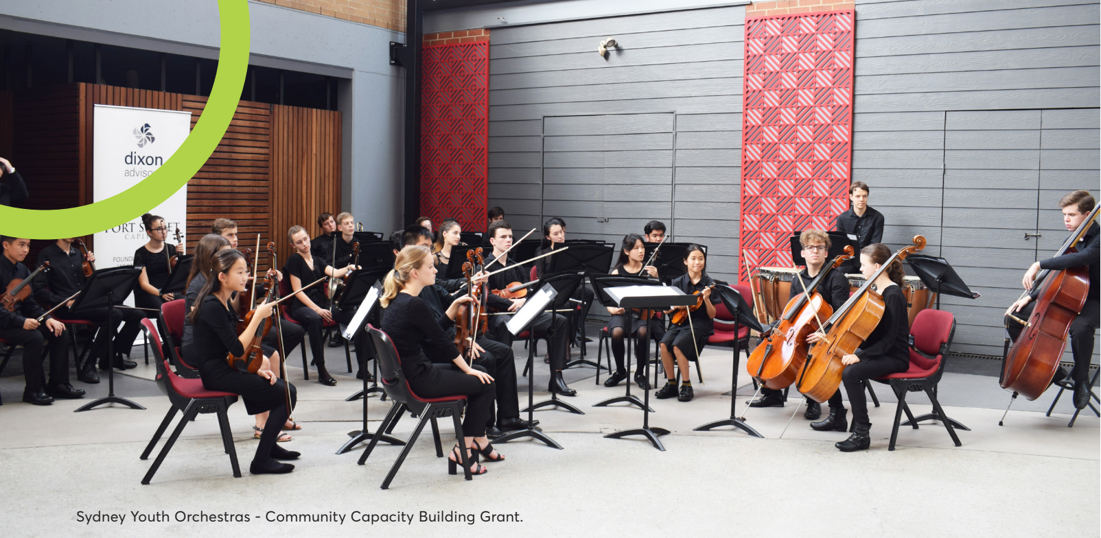
Sydney Youth Orchestras - Community Capacity Building Grant.