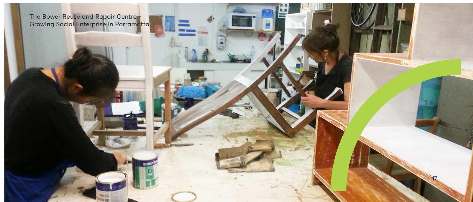
The Bower Reuse and Repair Centre – Growing Social Enterprise in Parramatta.