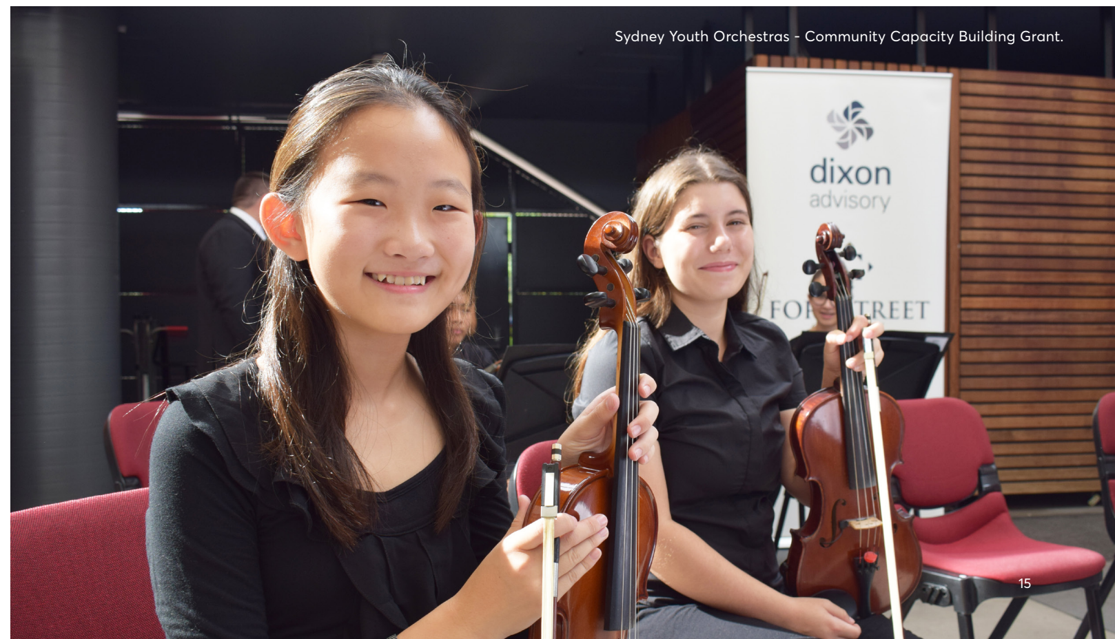
Sydney Youth Orchestras - Community Capacity Building Grant.